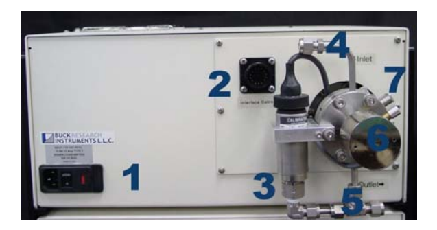
Fig. 1. Cryocooler unit