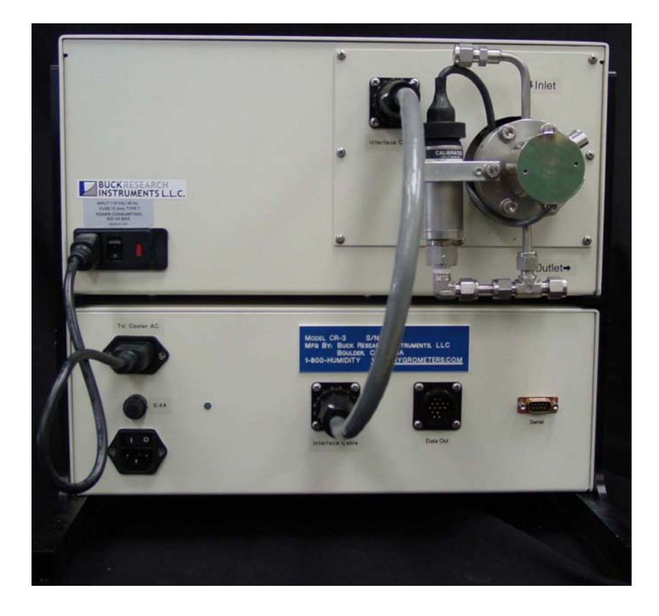
Figure 5. Complete unit with cables connected.